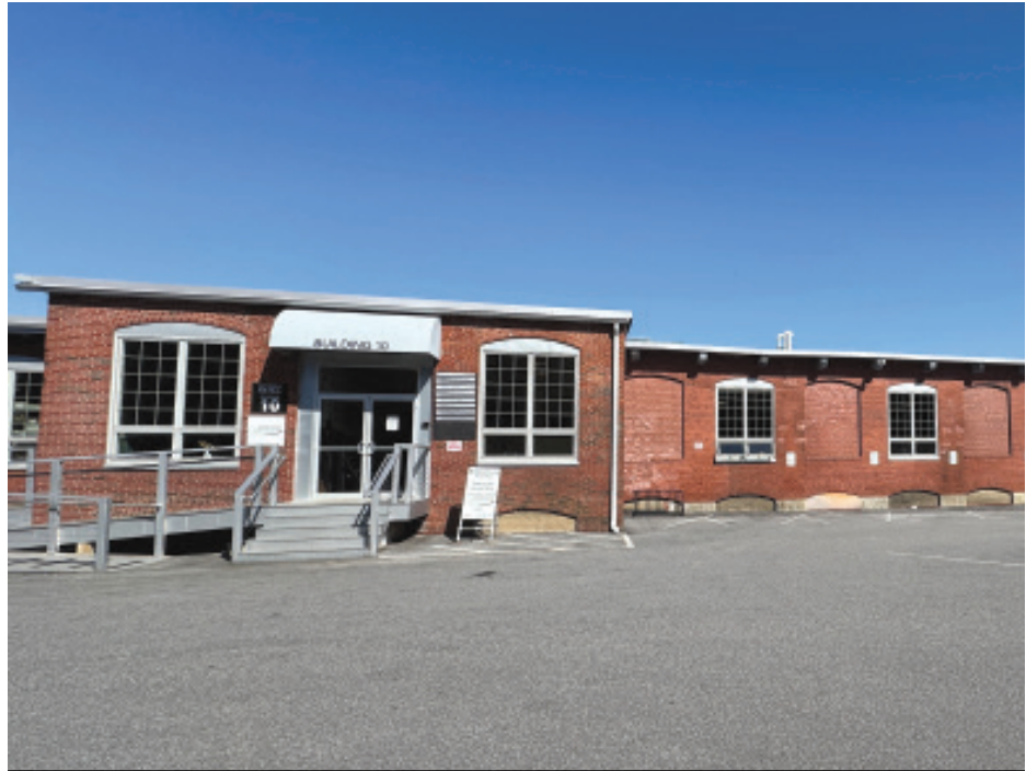
BUILDING 10 EXTERIOR AND PARKING