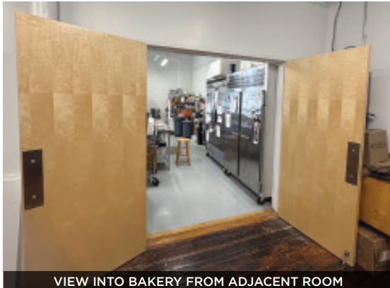
VIEW INTO BAKERY FROM ADJACENT ROOM