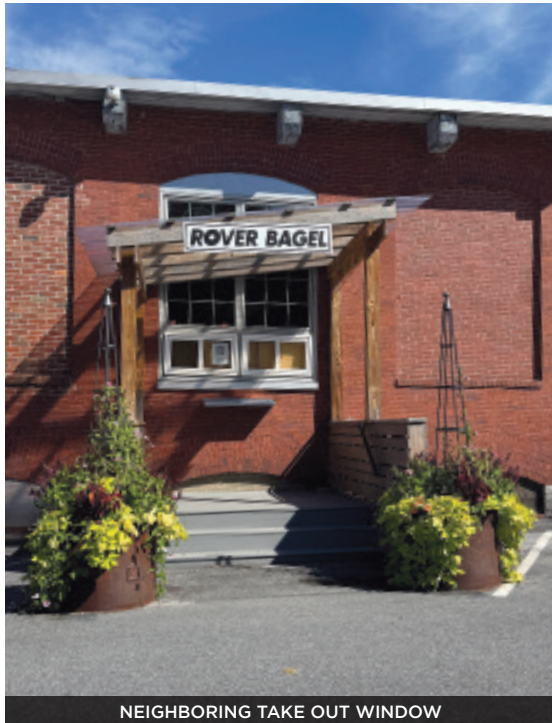
NEIGHBORING TAKE OUT WINDOW