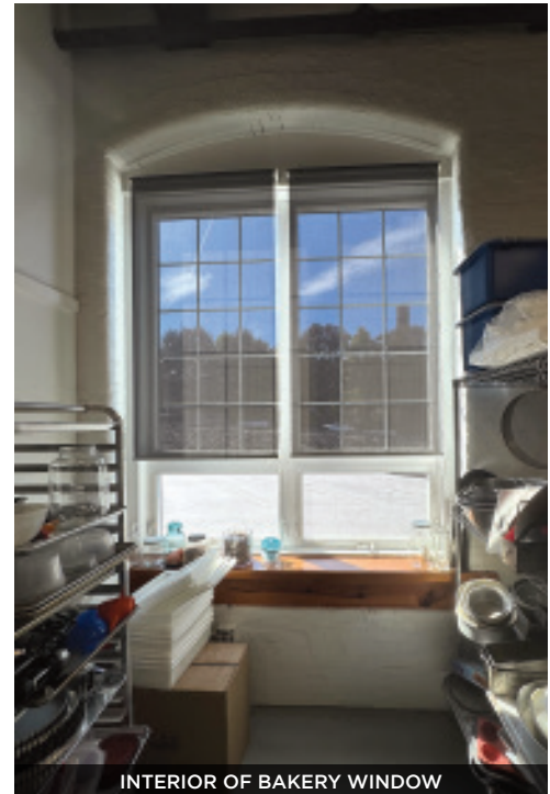
INTERIOR OF BAKERY WINDOW

Opportunity for possible take out window conversion noted in three above photos.