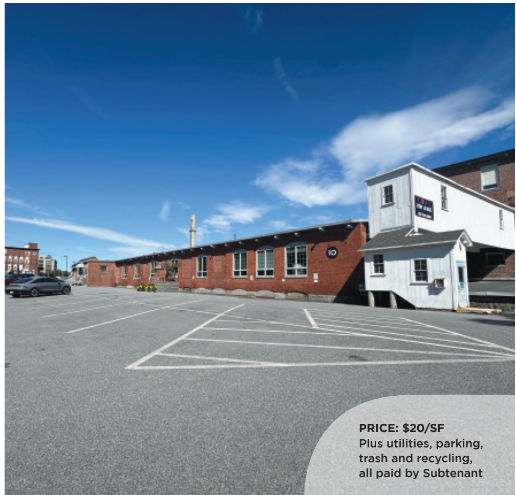
ABUNDANT ON SITE PARKING

PRICE: $20/SF Plus utilities, parking, trash and recycling, all paid by Subtenant