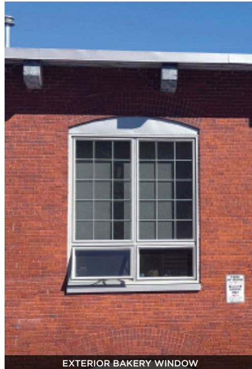
EXTERIOR BAKERY WINDOW