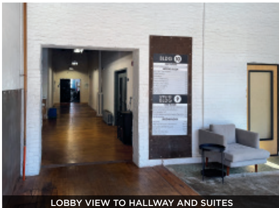
LOBBY VIEW TO HALLWAY AND SUITES

Opportunity for possible take out window conversion noted in three above photos.