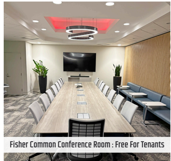
Fisher Common Conference Room : Free For Tenants