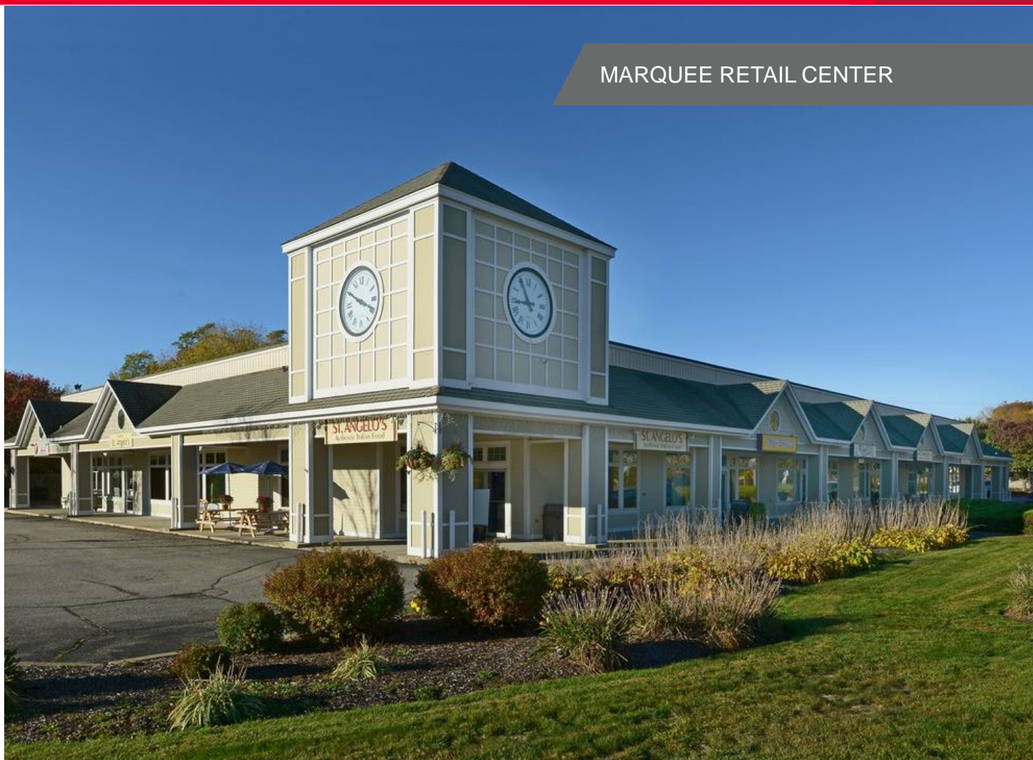
MARQUEE RETAIL CENTER