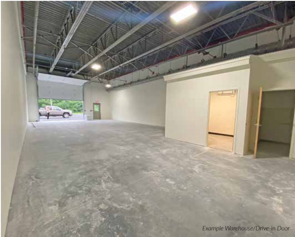
Example Warehouse/Drive-in Door