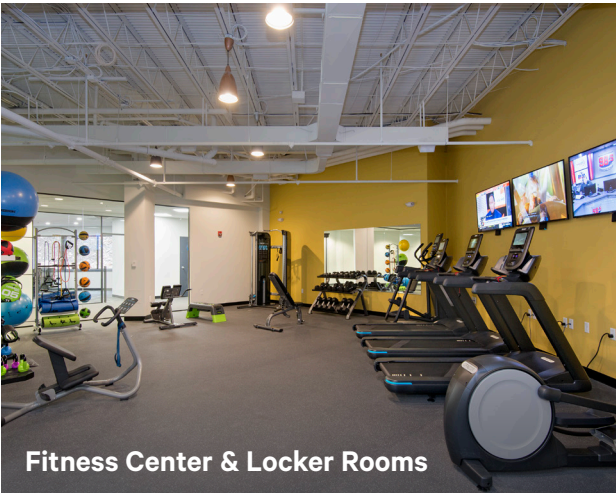
Fitness Center & Locker Rooms