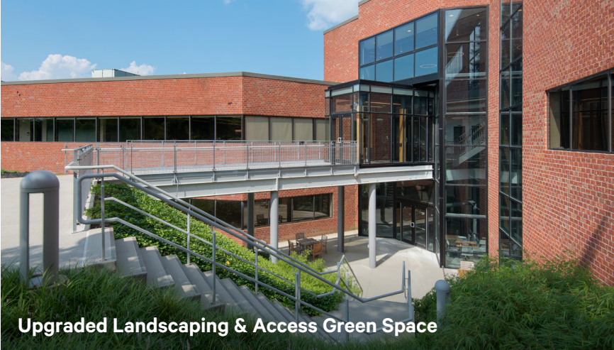
Upgraded Landscaping & Access Green Space