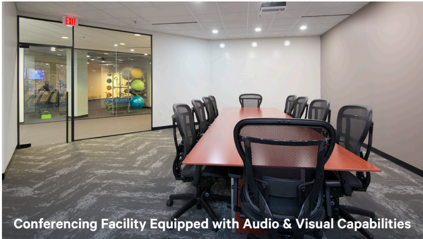
Conferencing Facility Equipped with Audio & Visual Capabilities