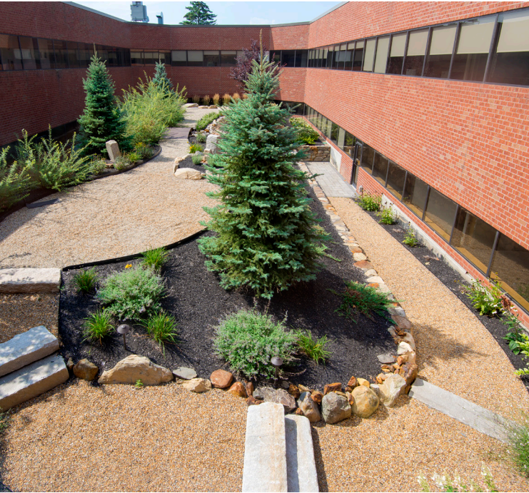
North & South Courtyards with Wi-Fi access