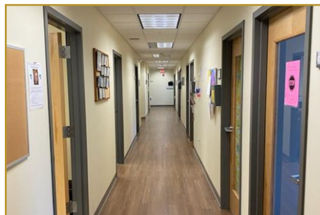
Lobby / Reception