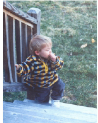
Children touching unsealed treated wood, and then putting their hands in their mouths is the biggest concern.

Too much arsenic can cause cancer. So it is good to prevent arsenic getting into your body when you can. When you touch wood treated with arsenic, you can get arsenic on your hands. The arsenic on your hands can get into your mouth if you are not careful about washing before eating. Young children are most at risk because they are more likely to put their hands in their mouths. The good news is that there are simple things you can do to protect yourself and your family from arsenic treated wood. This fact sheet will tell you how.