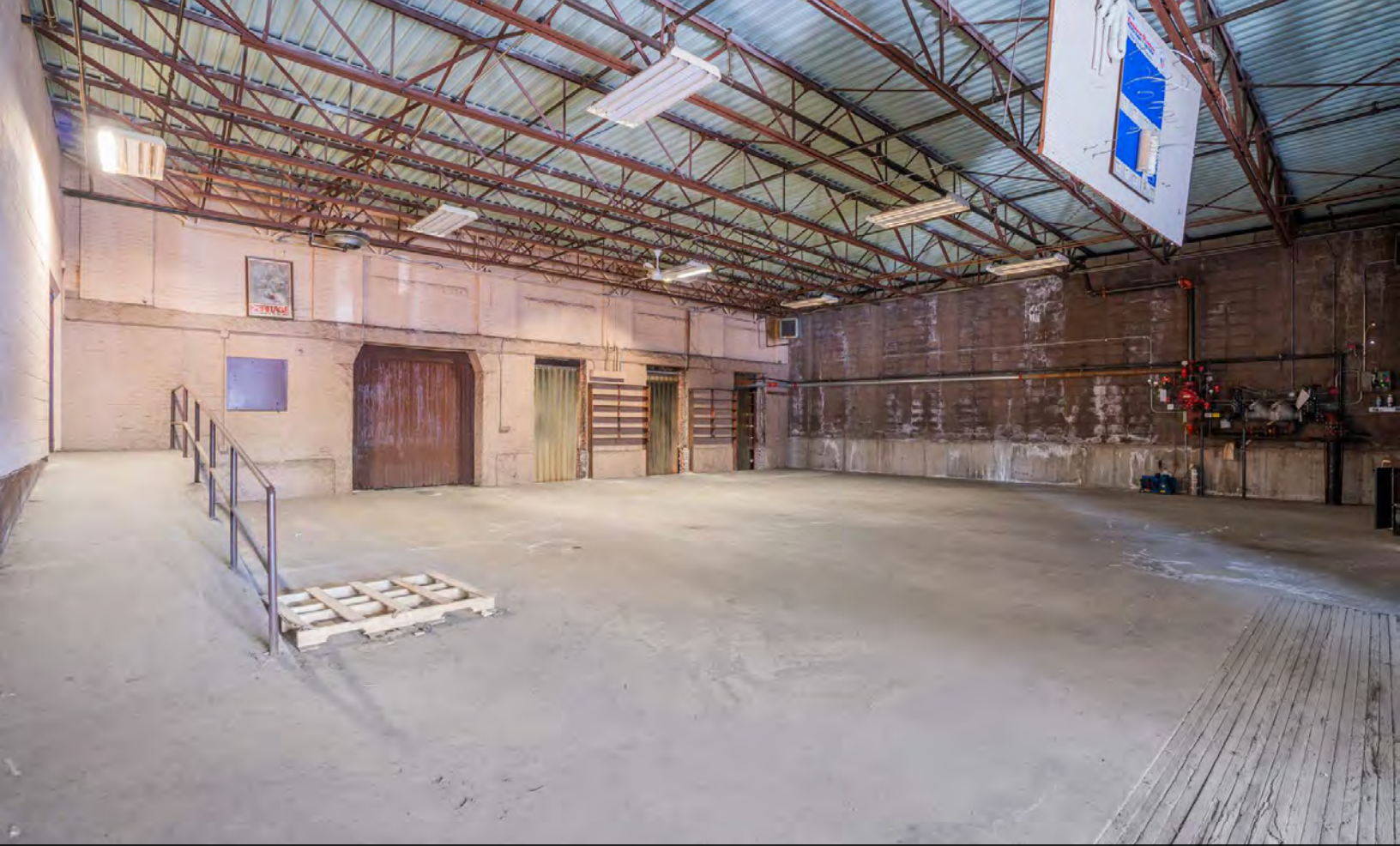
Building 1 - Interior Loading Area