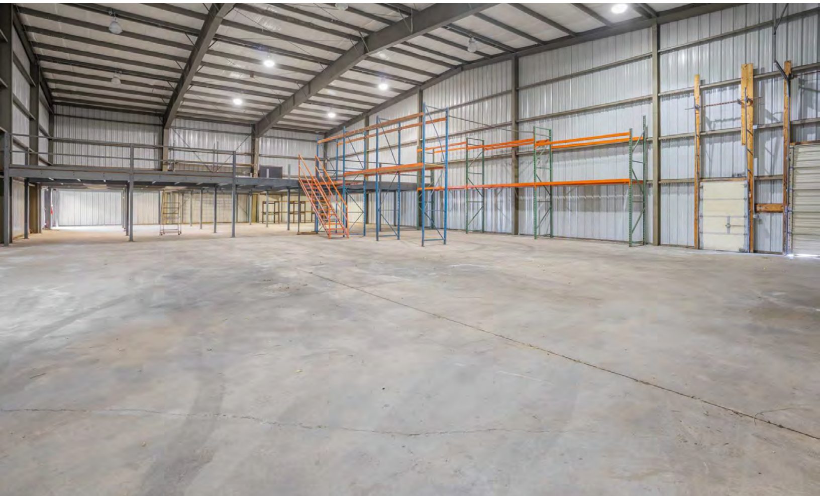
Building 2 - Interior