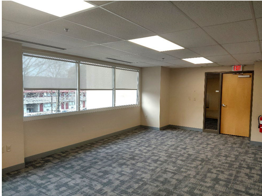
Suite Waiting Area