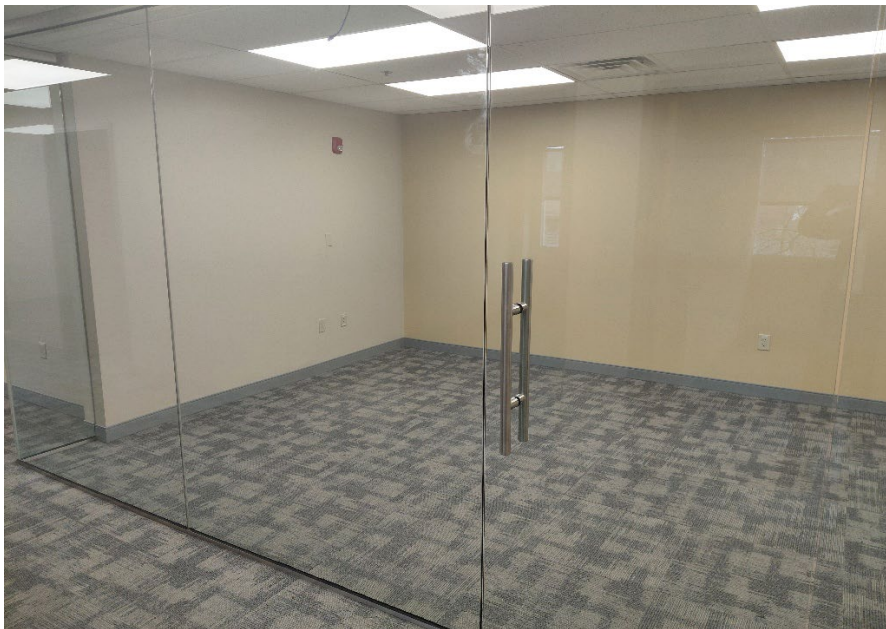
Glass walled office