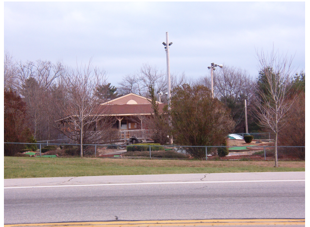
( http://images.vgsi.com/photos/LondonderryNHPhotos/\3000\885001.JPG )