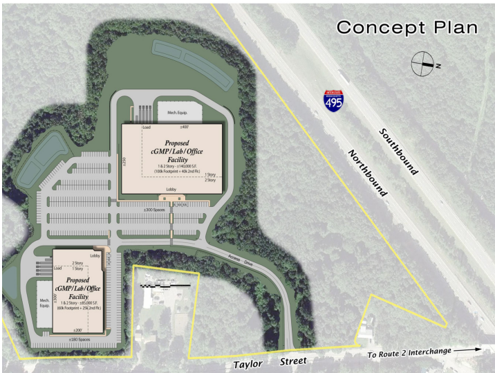
Littleton, Massachusetts Taylor Street