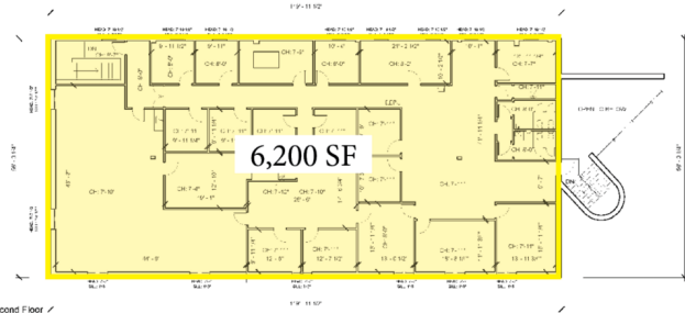
2 | Second Floor Scale: 1" = 10'-0"