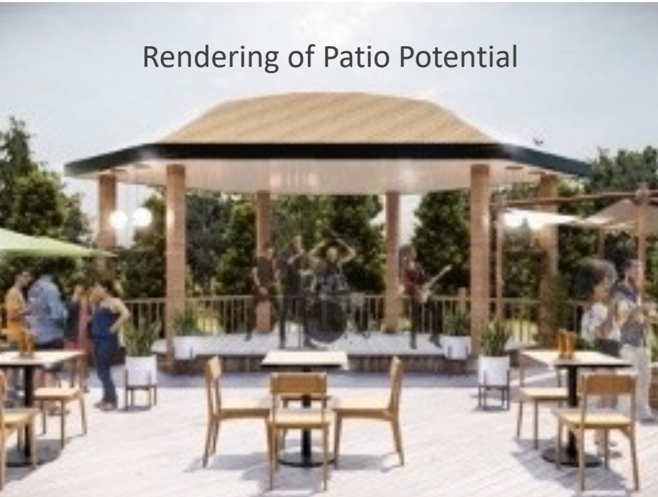
Rendering of Patio Potential