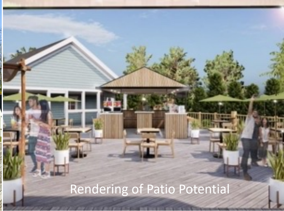
Rendering of Patio Potential