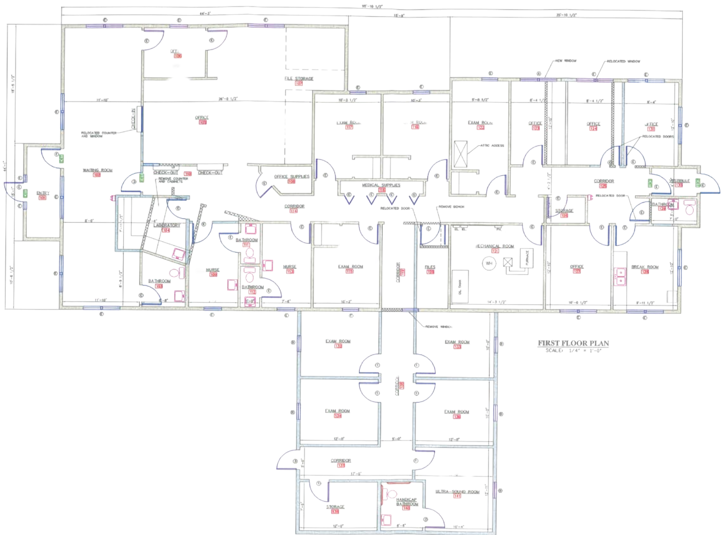
FIRST FLOOR PLAN SCALE: 1/4" = 1'-0"